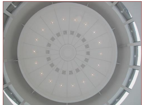
IMDADUL ISLAMIC CENTRE 26 LePAGE COURT, TORONTO

IJ has consequently located a suitable property right next door, an industrial building at 30 LePage Court to be annexed to the current centre. The acquisition of this building addresses a long awaited facility to serve the growing need of the community in North York. While the site area is 30000 square feet, this one-storey, detached brick building provides an approximately 12000 square feet of additional building area with high ceilings and good lighting.